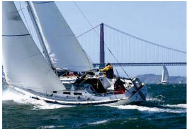
CASSIOPEIA - SAN FRANCISCO BAY 2009