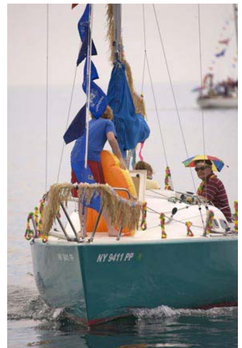
Sail Past Parade 2008