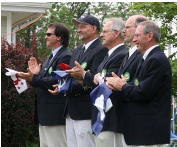
Doesn't Sail Past seem like yesterday?