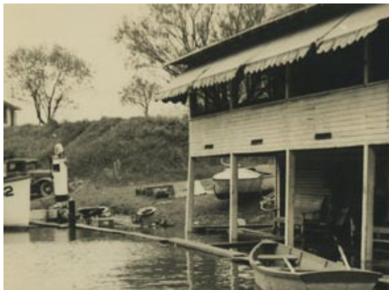
The Wilson Boat House

Remember, You can receive CURRENTS electronically on line at www.tycwilson .