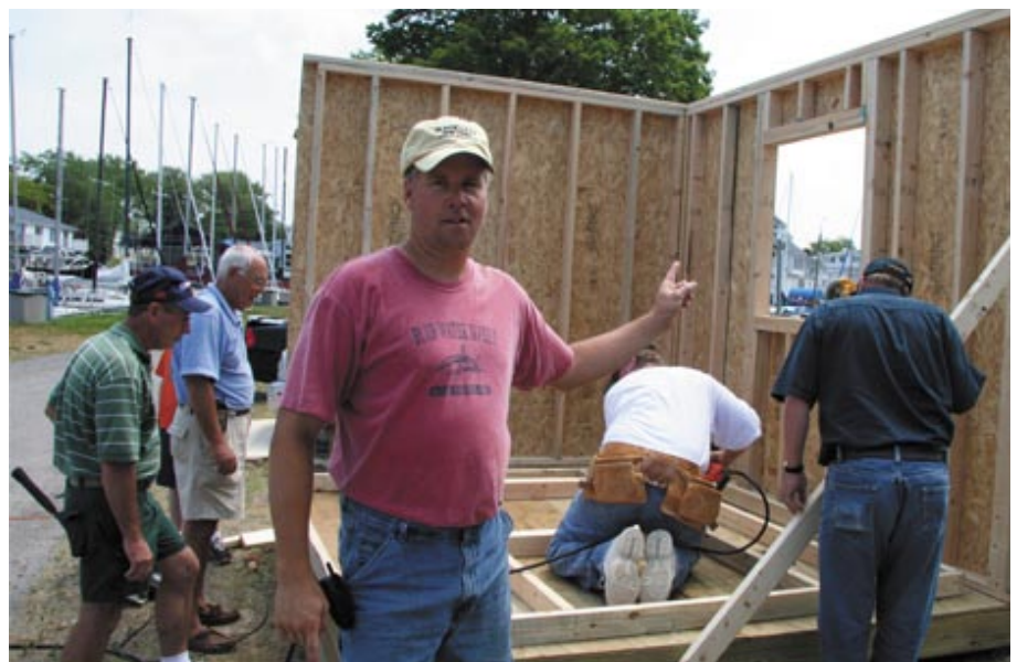
The Director of Harbor Operations keeps his crew of volunteers working on the new Steward's Office