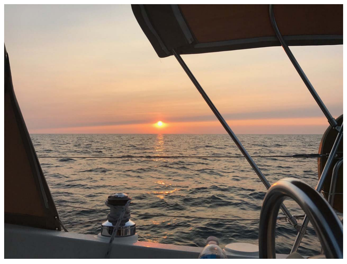
This fall outside of Wilson harbor.