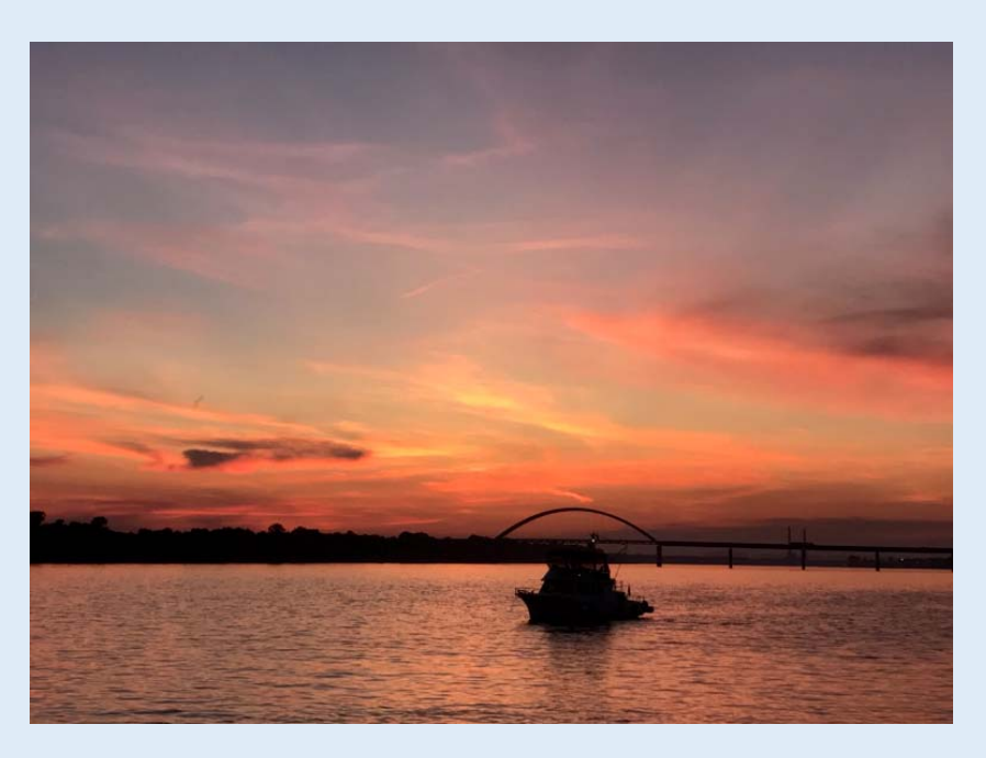
Lock 52: 7 hours later ...