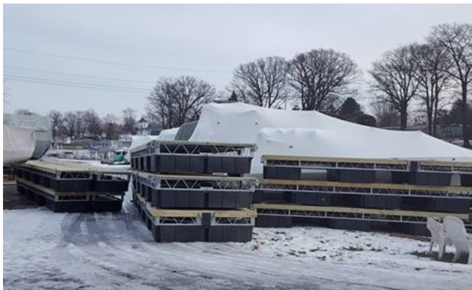
The new floating docks waiting to be installed.