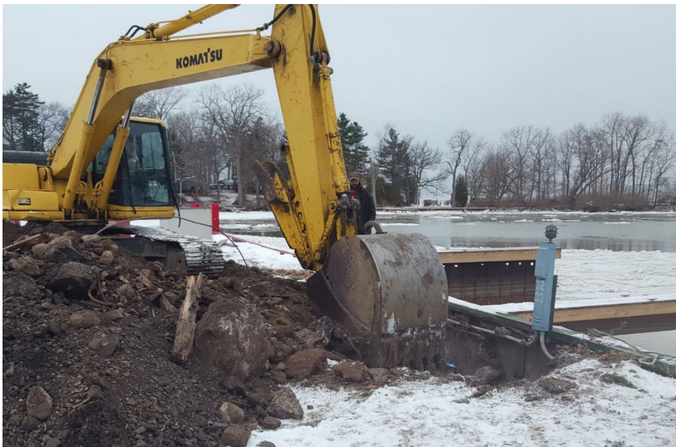
Clark's men with an excavator repairing the north channel wall in January.