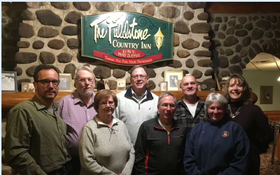
Your Board of Directors (BOD) at work! February meeting.