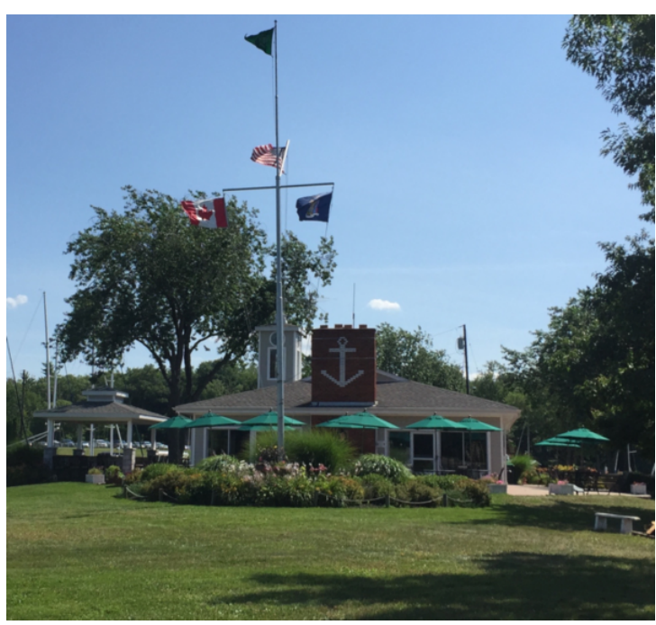
New Patio Umbrellas