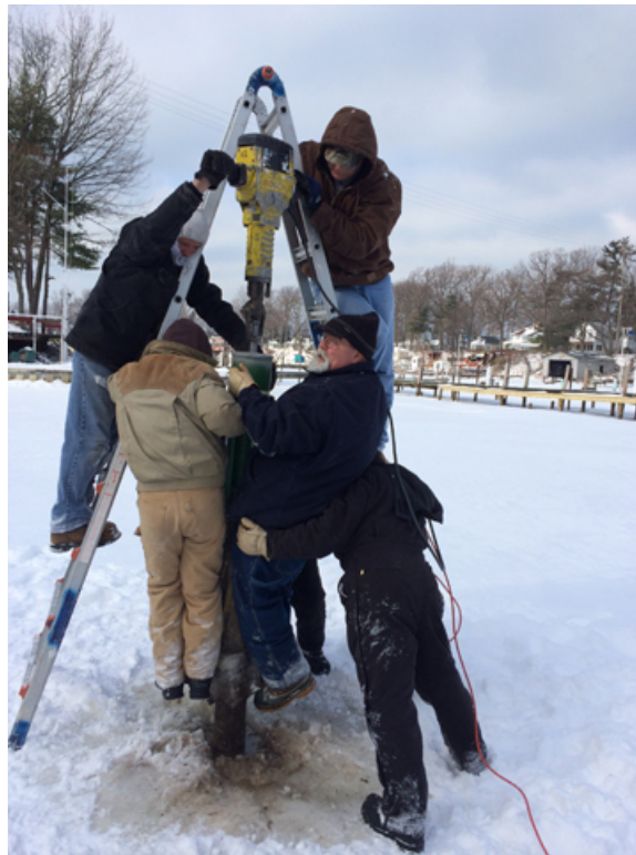
TYC members hard at work driving a post in Haines