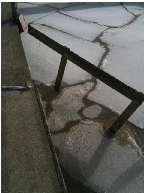
Ice damage from vertical dock boards