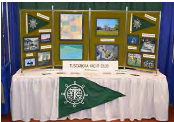
TYC information booth at the recent boat show.