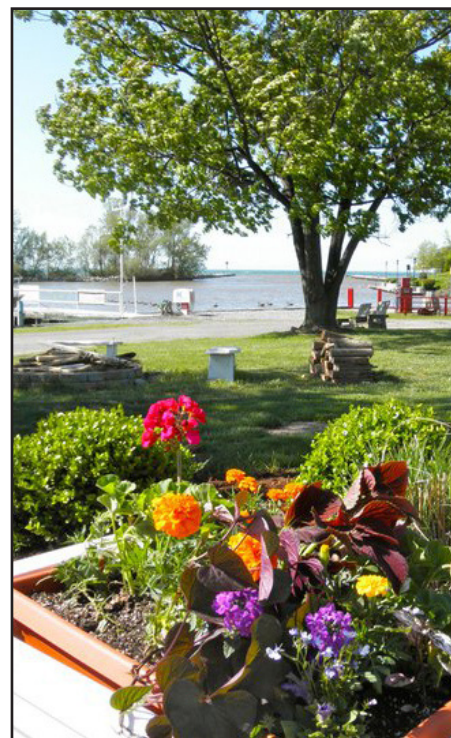
Our grounds have never looked so good