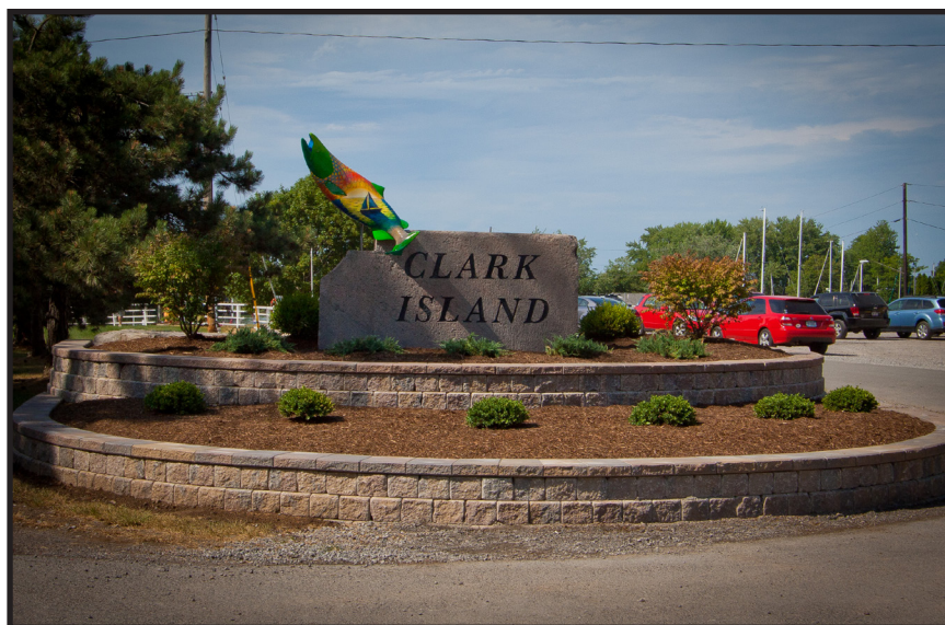
The newly designed entrance to Clark Island and TYC

Finally, there have been one or two minor occurrences having to do with mis-interpretation of TYC policies, usually visitors or new members. If there is any question regarding any policy interpretation, please refer the question to any Board member for clarification. There is almost always one around, or if necessary, a phone call would be welcome.