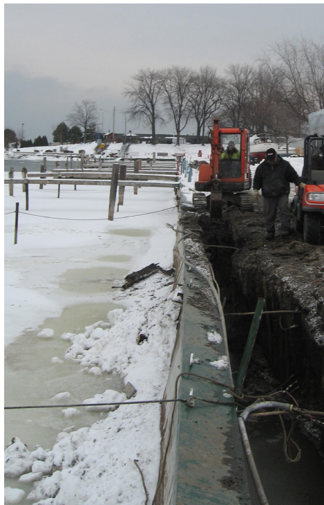
Clark Marina Corp workers continue to work on the west wall this past week.