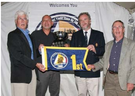
Gypsy Wind takes 1st Place in the LO300

Also, after the water freezes we will be doing some very much needed repairs to the docks in Haines. There are several docks that need pipes replaced and several slips that need posts pulled and reset. Hopefully we will have a good cold winter so we can get a few work parties organized to accomplish these tasks. Thank you some much for your help and support.